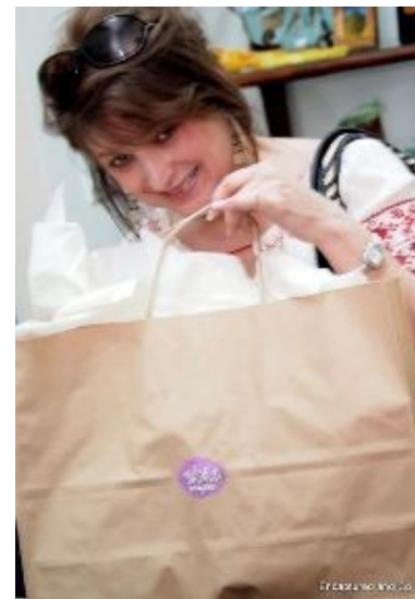
A very happy customer at the new Arts On Main Gift Shop

Santa Fe, New Mexico, the #2 ranked Art City in the US has roughly the same population as Gastonia. Which is not to say that we could ever compare ourselves to Santa Fe! Before becoming the art mecca it is now, Santa Fe was just a spot in the desert, though. It could take generations to turn Gastonia into a place where artists are taken seriously and respected. Let's ALL get started!