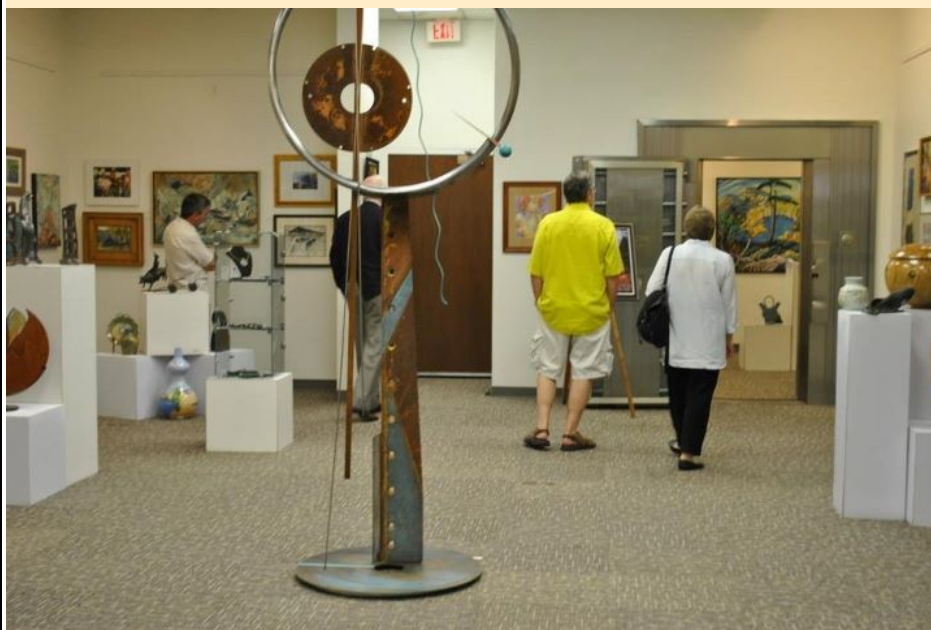
A couple heads to the vault to view the Ivan Horvat Exhibit at Arts On Main